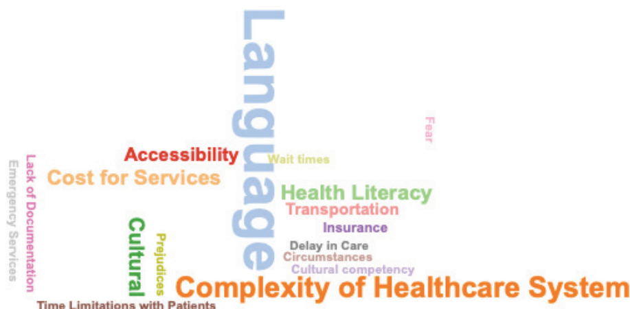
Figure 2. Word cloud representing subthemes of the main theme “Barriers.” Language was the most frequent; this is depicted by the word “language” being the largest in size.